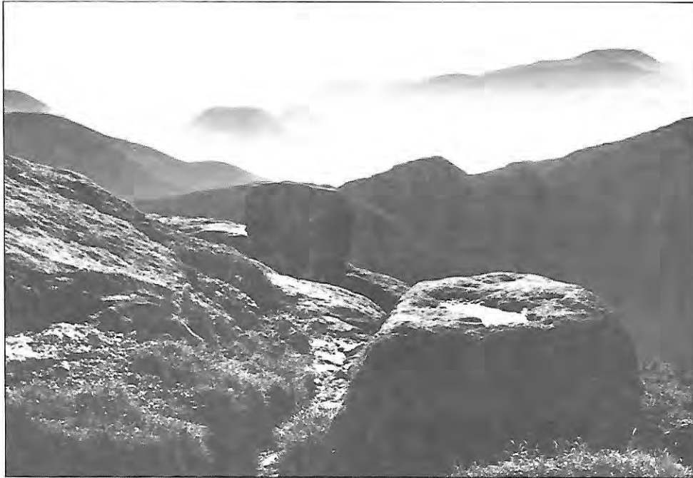
On Marcy